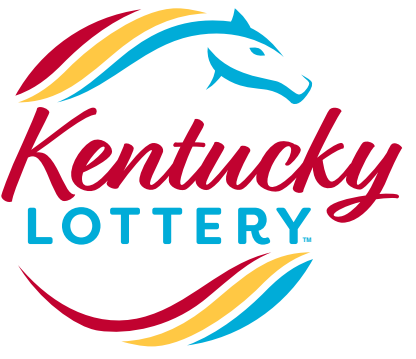
Fueling Imagination. Funding Education.

Kentucky's "Big 3" are the Kentucky Educational Excellence Scholarship (KEES), the College Access Program (CAP) grant, and the Kentucky Tuition Grant (KTG) program. KEES is Kentucky's incentivebased program that rewards academic achievement in high school